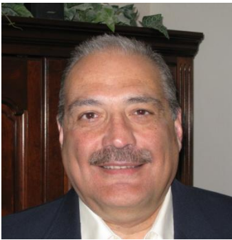
BJC and Associates, LLC.

Serving Eastern PA, NY, NJ, DE, MD and VA