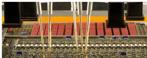
Acculogic's Flying Probe Test Systems