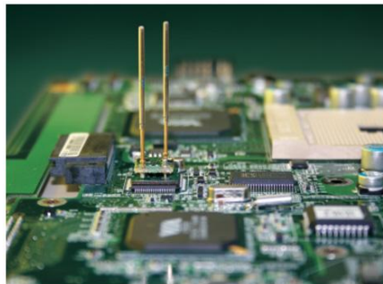
Teradyne's powered FrameScan uses boundary scan for reduced access testing

Examples of some of the technology being represented